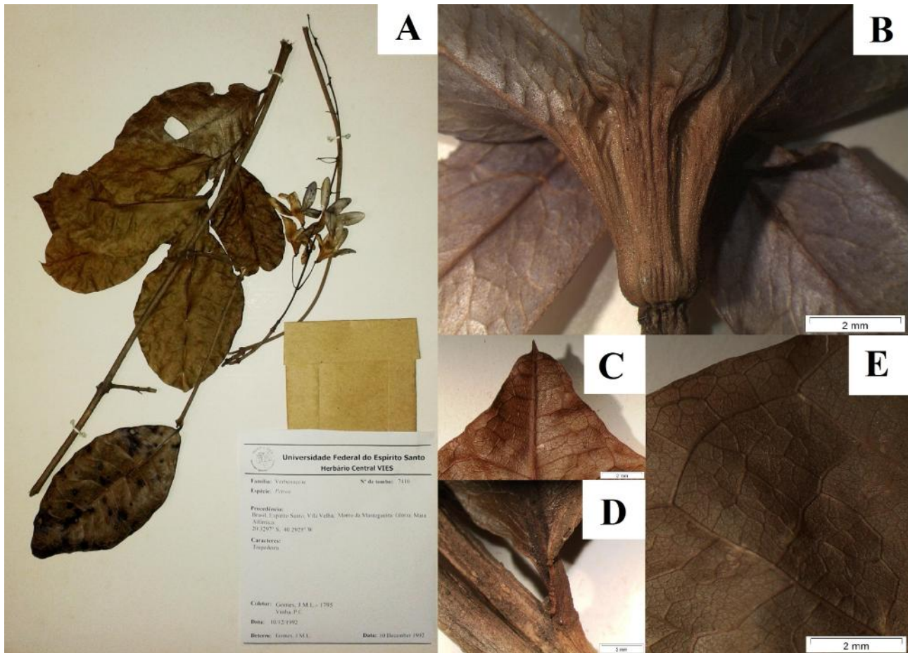
Figure 3. Petrea volubilis . A. Habit. B. Detail of the calyx. C. Apical region of the leaf. D. Petiole and leaf basal region. E. Margin and leaf venation.

These results confirm the importance of the botanical collections for the study of the biodiversity at the regional level. Herbarium collections act as true database about the flora and they are the basis of knowledge about its composition, distribution and conservation. These data contribute in a decisive way to creation of protection areas for the conservation of species under different degrees of threat.