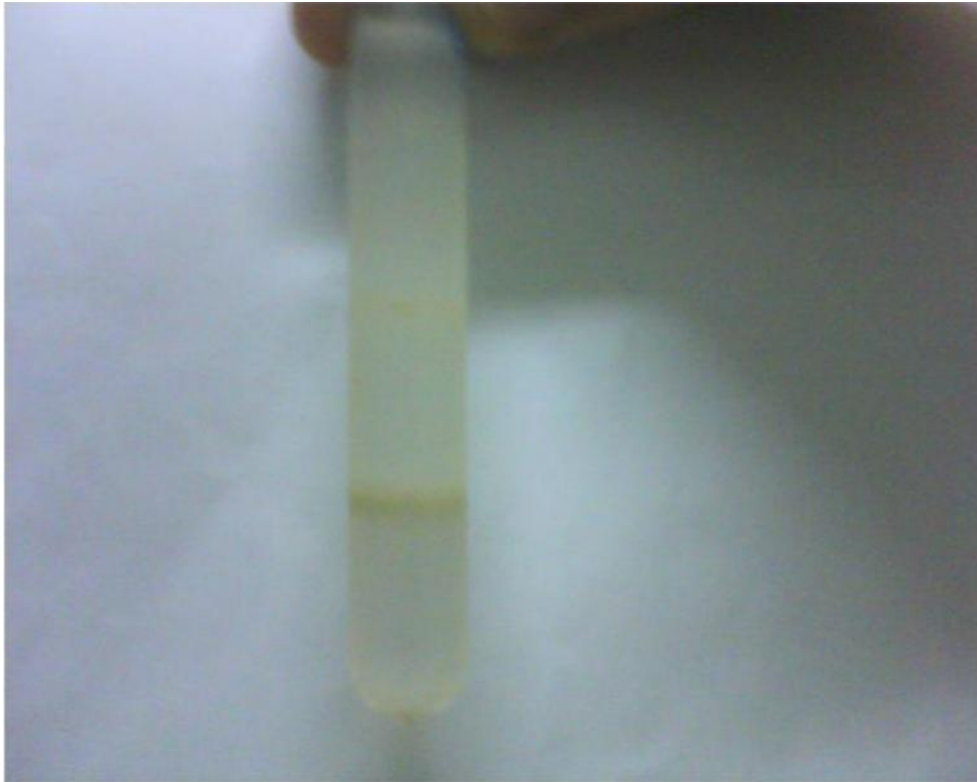
Figure 1. Separation of membranes of organelles from the V. unguiculata secretory pathway in Sucrose density

In order to verify the effect of saline stress on the H^+ -PPase activity of membranes from different organelles from secretory pathway of the V. unguiculata , isolation, fractionation and analysis of hypocotyl membranes from this plant were performed. As a result, it was possible to observe H^+ transport dependent on PPi in total membranes of plants submitted to 200 mM NaCl as well as in the total membranes of those plants that were not submitted to saline stress (control). The transport of H^+ can be visualized by the drop in fluorescence intensity.